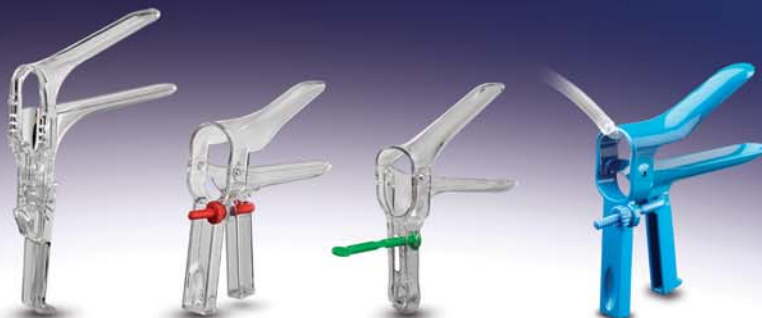
Graves Screw & Nut Central Key Smoke Evacuator

To Order: Agit Technologies (Israel) www.Agit.co.il